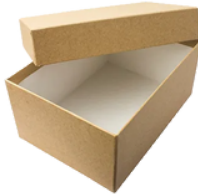
FTD (Full Telescope Design Style Box)