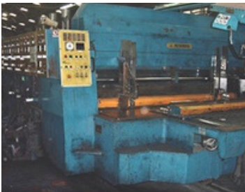
(P4) 2C Flexo printing slotter FG115

TIEN CHIN YU MACHNERY 3 COLORS Max sheet size 1,620 x 3,000 mm. Min sheet size 550 x 900 mm.