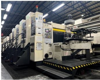
(F1) 4C Flexo printing slotter and Dic-cutter folder glue

Lati tude Machinery Max sheet size 988 x 2,450 mm. Min sheet size 280 x 700 mm.