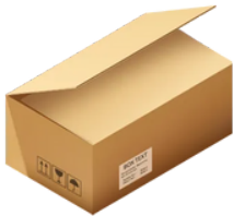
OSC (Overlap Slotted Container)