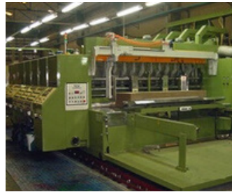
(P5) 3C Flexo printing slotter and Die-cutter

Lati tude Machinery Max sheet size 988 x 2,450 mm. Min sheet size 280 x 700 mm.