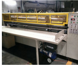
Thin Knife machine

Mitsubishi Summit 115 Japan Max sheet size 1,220 x 2,930 mm.