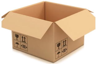
RSC (Regular Slotted Container)

“ Produces all types of corrugated cardboard boxes as well as sells equipment used for packaging products. With over 30 years of experience ”