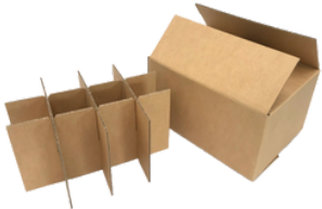
BOX + Partition