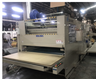
(AP) AUTO PLATEN MIKAWA AP 1400

Max Sheet size 1020 x 1400 mm. Min Sheet size 300 x 450 mm.