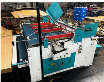
Semi Auto glue

Max Sheet size 1020 x 1400 mm. Min Sheet size 300 x 450 mm.