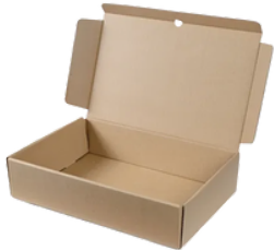
(Die-Cut) Box (Die-Cut)